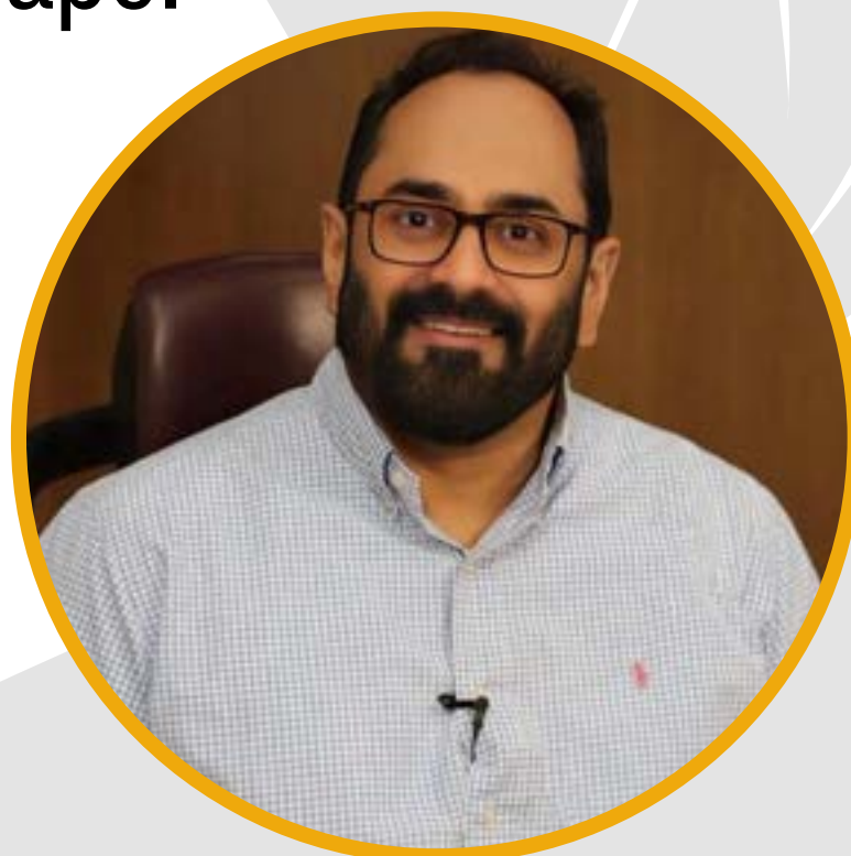
HON'BLE SHRI RAJEEV CHANDRASEKHAR

Key functions of MeitY include policy formulation related to information technology and electronics, promoting IT education, and overseeing cyber laws. It is instrumental in driving initiatives like Digital India, aimed at bridging the digital divide and enhancing the nation's global role in internet governance. MeitY's vision is centered on leveraging e-development for India's transition into a developed nation and an empowered society. Through its comprehensive approach, MeitY is committed to enhancing efficiency through digital services, promoting inclusive growth, and securing India's position in the global digital landscape.