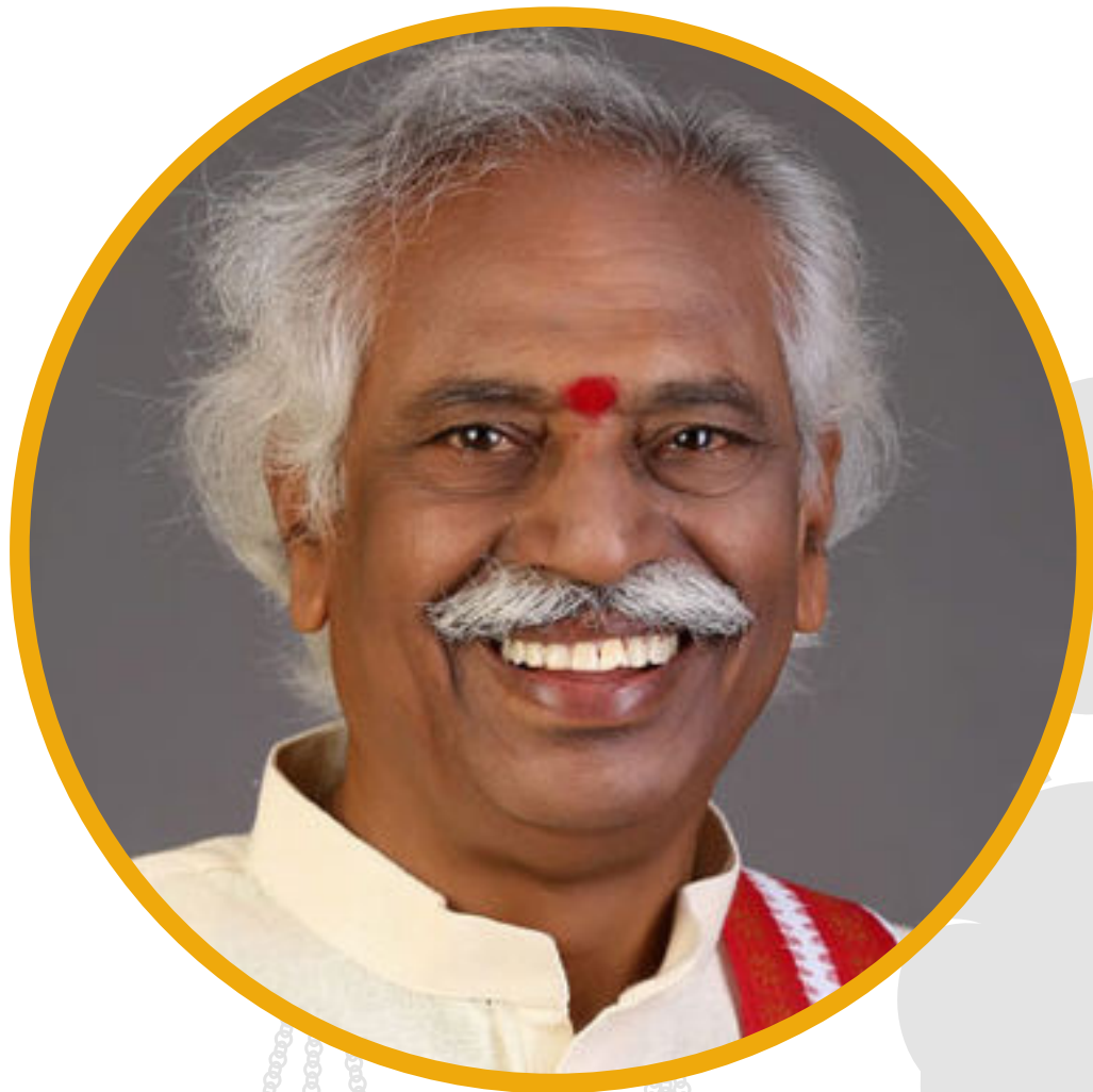
HON'BLE SHRI BANDARU DATTATRAYA

HON'BLE GOVERNOR OF HARYANA & CHANCELLOR, DR. B.R. AMBEDKAR NATIONAL LAW UNIVERSITY, SONEPAT