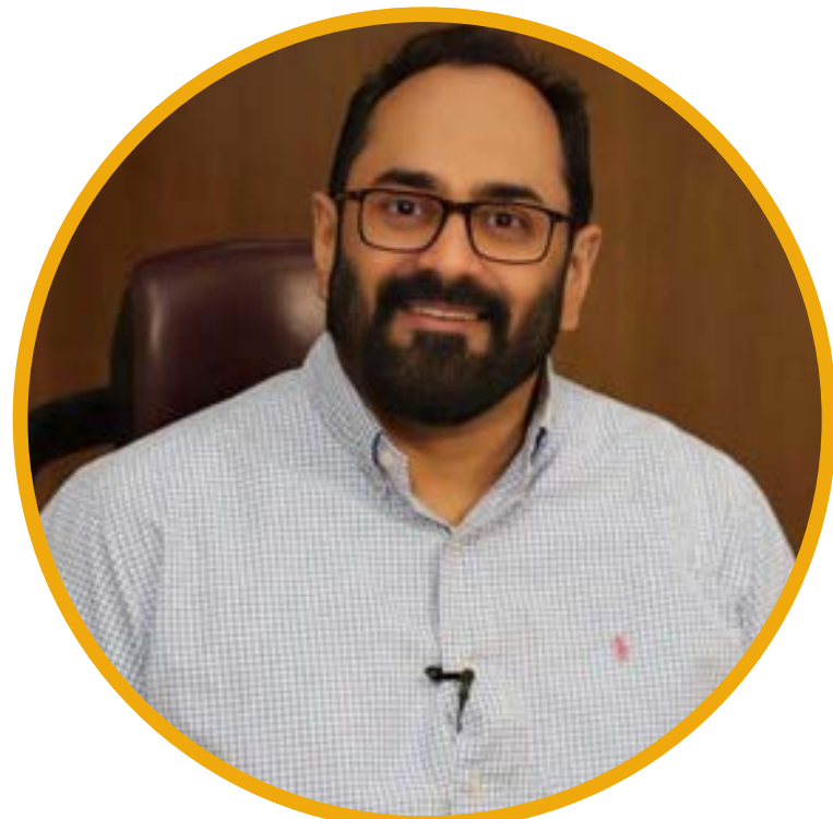
HON'BLE SHRI RAJEEV CHANDRASEKHAR

HON'BLE UNION MINISTER OF STATE (I/C) FOR LAW & JUSTICE, PARLIAMENTARY AFFAIRS AND CULTURE, GOVT. OF INDIA