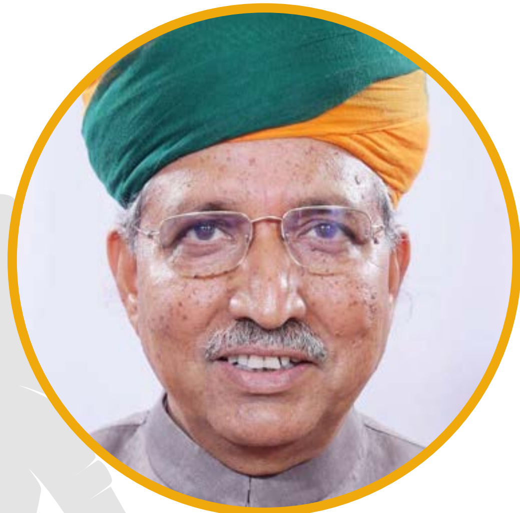
HON'BLE SHRI ARJUN RAM MEGHWAL

HON'BLE GOVERNOR OF HARYANA & CHANCELLOR, DR. B.R. AMBEDKAR NATIONAL LAW UNIVERSITY, SONEPAT